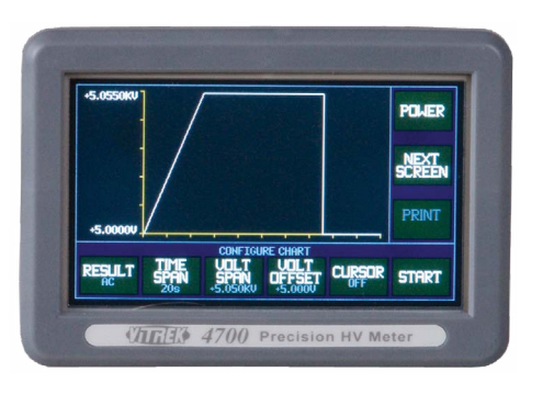
Chart Mode automatically plots voltage readings from a few seconds to several days. Highly useful for determining ramp linearity, overshoot and sag on hipot testers and other HV sources.

Automate your HV test requirement with the 4700's built-in Ethernet port, high speed serial communication port or available GPIB. The 4700 is fully programmable—so you can select your measurement mode and bandwidth, then take readings as often as desired. The 4700 also comes standard with a USB printer port, to capture readings and get hardcopy printouts of HV plots—so you can document the sag or overshoot in a typical hipot test.