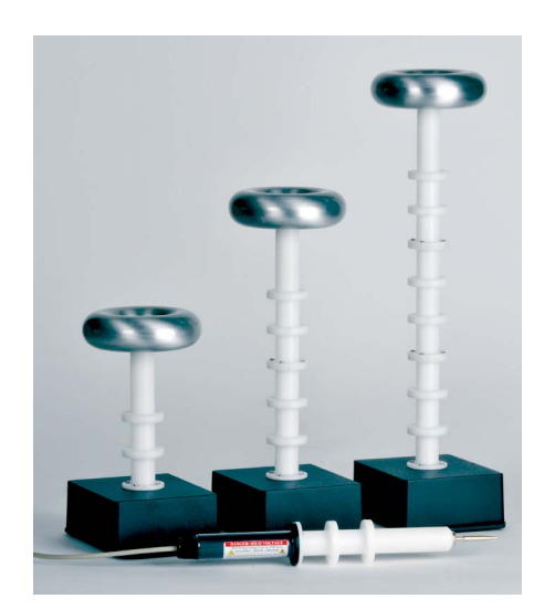
HVL Series High Performance Lab Grade, HV-SmartProbes™ shown above in 35KV, 70KV and 100KV models. Handheld HVP-35 portable HV-SmartProbes™ shown with detachable probe tip.

Vitrek's 4700 precisely measures voltages directly up to 10KV, right out of the boxwith no external probes. That's high enough for most of the HV sources out there. However, should you care to expand your high voltage measurement range—just add one or more of the available 35KV, 70KV, 100KV and 150KV SmartProbes™. The Vitrek SmartProbes™ each store their own calibration data which is down loaded when they are plugged in to the 4700—this results in high accuracy, calibrated readings and allows any Vitrek SmartProbe™ to be used with any 4700 HV Meter. The SmartProbe's™ proprietary, ultra-low TC attenuator design minimizes self-heating—while its low capacitance technology enhances AC